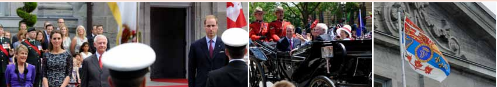
Their Royal Highnesses The Duke and Duchess of Cambridge toured Canada from June 30 to July 8, 2011. A new personal flag for The Duke of Cambridge for use in Canada, created by the Canadian Heraldic Authority, was unveiled at Rideau Hall on June 29, 2011.