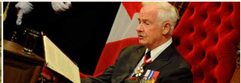
The Speech from the Throne was read in the Senate Chamber on June 3, 2011.

In 2011-2012 more than 95 activities associated with representing the Crown in Canada were supported by the Office.