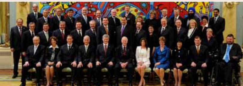
The Governor General presided over the swearing-in of the Canadian Ministry on May 18, 2011, at Rideau Hall.

One of the Governor General's responsibilities is to ensure that Canada always has a Prime Minister. The Governor General presides over the swearing-in of the Prime Minister, the Chief Justice of Canada and cabinet ministers; summons, prorogues and dissolves Parliament; delivers the Speech from the Throne; and gives Royal Assent to acts of Parliament. He acts on the advice of the Prime Minister, but has the right to advise, encourage and warn.