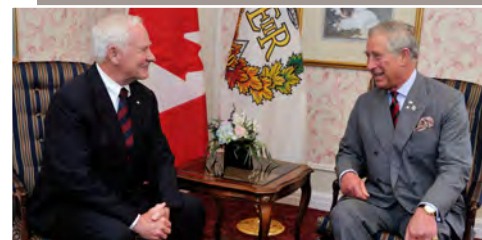
His Royal Highness The Prince of Wales met with the Governor General on May 24, 2012, during his Royal Tour of Canada.