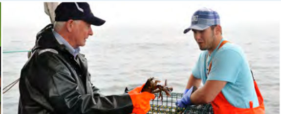
In Yarmouth, His Excellency went lobster fishing, an activity that is vital to the area's economy.