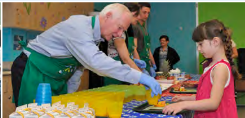
His Excellency helped volunteers serve breakfast to students at Notre-Dame Elementary School.