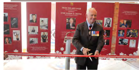
On May 17, 2012, the Governor General officially opened the exhibit From Far and Wide – Honouring Great Canadians in downtown Ottawa.