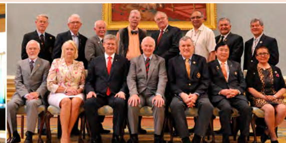
The participants of the annual conference of lieutenant governors and commissioners had the opportunity to meet with the Prime Minister at Rideau Hall.