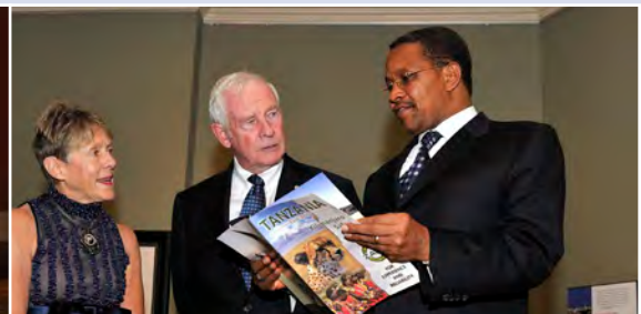
His Excellency Jayaka M. Kikwete, President of the United Republic of Tanzania, began his State visit to Canada on October 3.