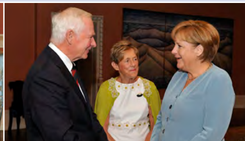
Her Excellency Dr. Angela Merkel, Chancellor of the Federal Republic of Germany, met with Their Excellencies on August 16.