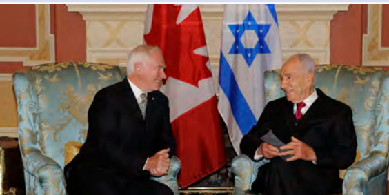
On May 7, His Excellency Shimon Peres, President of the State of Israel, began his State visit to Canada.