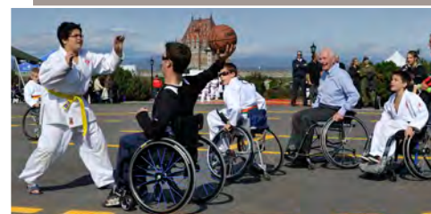
On October 22, 2012, the public was invited to a Fall Celebration at the Citadelle of Québec. A wheelchair basketball game was one of the activities that highlighted the benefits of physical activity.