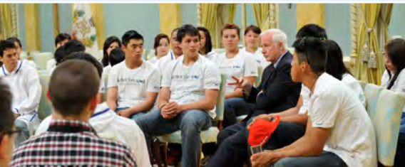
His Excellency hosted a discussion with participants of the 2012 Northern Youth Abroad program.

The Governor General participates in commemorative ceremonies and national celebrations, provincial and territorial visits, and community activities across the country. He also hosts events at both official residences: Rideau Hall and the Residence of the Governor General at the Citadelle of Québec.