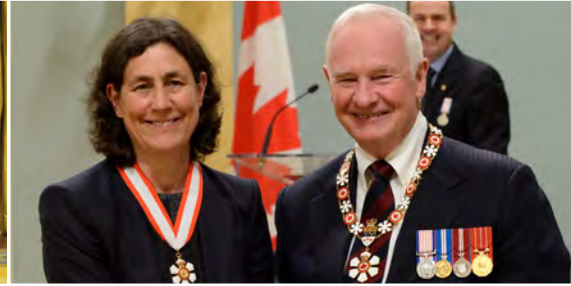
Chantal Hébert, O.C., was among 44 recipients invested into the Order of Canada at a ceremony at Rideau Hall, on November 23, 2012.

The Office, through the Chancellery of Honours, administers all aspects of the Canadian Honours System, as well as the Governor General's Academic Medal, the Governor General's Caring Canadian Award, and the Governor General's Northern Medal.