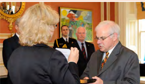
The Honourable Peter Milliken was sworn-in as a member of the Queen's Privy Council for Canada.