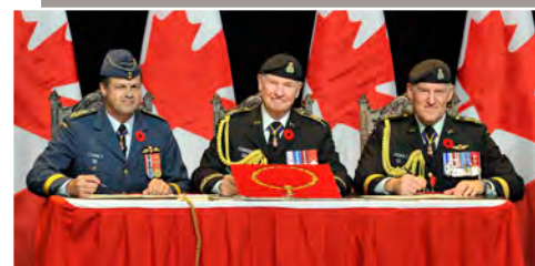
His Excellency, as commander-in-chief, signed the Change of Command certificates at the Canadian Forces Change of Command ceremony on October 29, 2012.