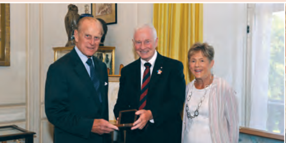
His Excellency presented a Diamond Jubilee Medal to His Royal Highness The Duke of Edinburgh, a member of the Queen's Privy Council for Canada.