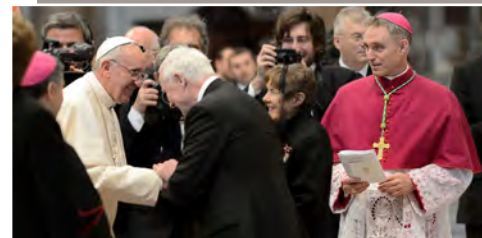
Following the Inaugural Mass on March 19, 2013, Their Excellencies were honoured with a brief audience with Pope Francis.